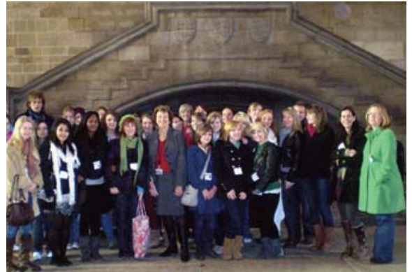
Annette Brooke, MP, meets the party at the Houses of Parliament