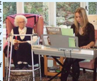
Offering support at a local care home

I really enjoy going and am so glad that I was given the opportunity - my week wouldn't be complete without it!"