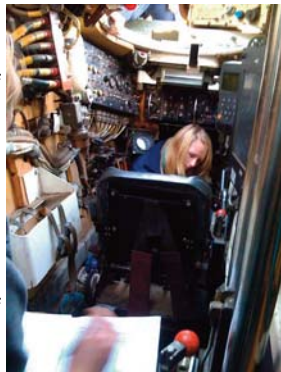
Inside the CRARRV

The team were lucky enough to get the opportunity in November to visit the Bordon Army base in Hampshire to actually see the vehicle. To the team's surprise (and delight) they were allowed onto and in it. This took a bit of doing as it is very large (68 tonnes worth of armoured vehicle is quite a lot!). The girls were able to take many photos and measurements and ask questions of the drivers and the engineers who maintain it. The students' guide was very impressed with the team and the questions they asked although he did at one point say that he had never seen anyone manage to get into the positions that the team did whilst they were taking photos!