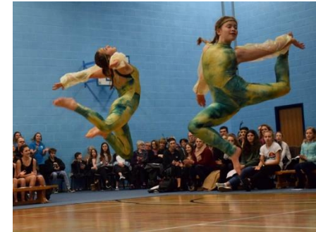
Gym and Dance 2018