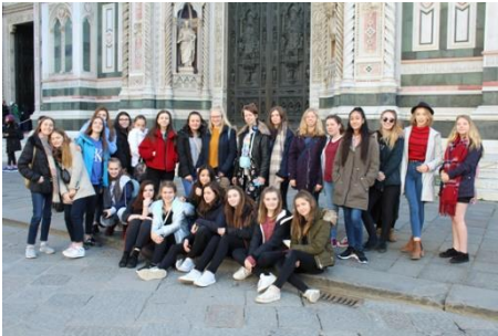
Florence trip 2018