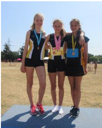
Sports Day 2018