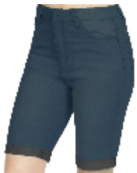
Additional length for fitted shorts