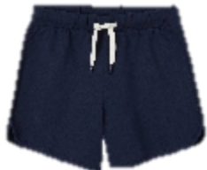
Loose Cotton Sport Shorts (Short)