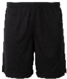
Loose Cotton Shorts

Length/Coverage: Length should provide adequate coverage for activities and not excessively expose the leg.