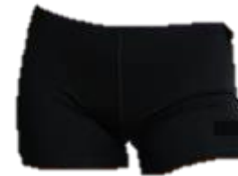
Very short Fitted shorts