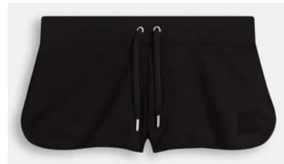
Very short loose shorts

Length/Coverage: No 'short' shorts that do not provide sufficient protection during activities