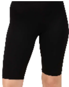
Additional length for fitted Lycra shorts