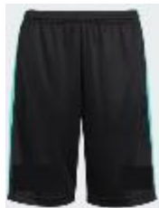
Loose Cotton Sport Shorts (Long)